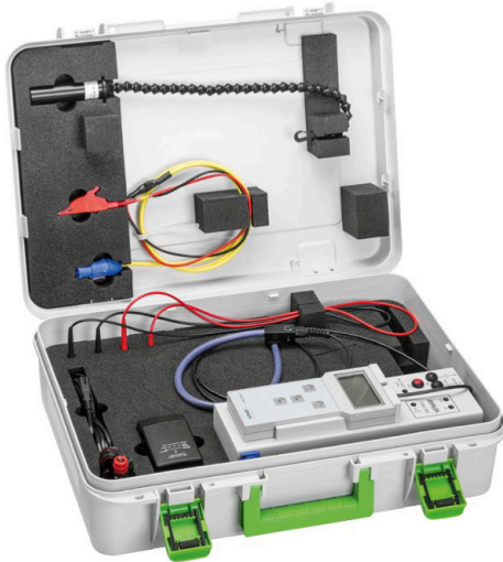
Figure: KSG 200 TA (with battery)