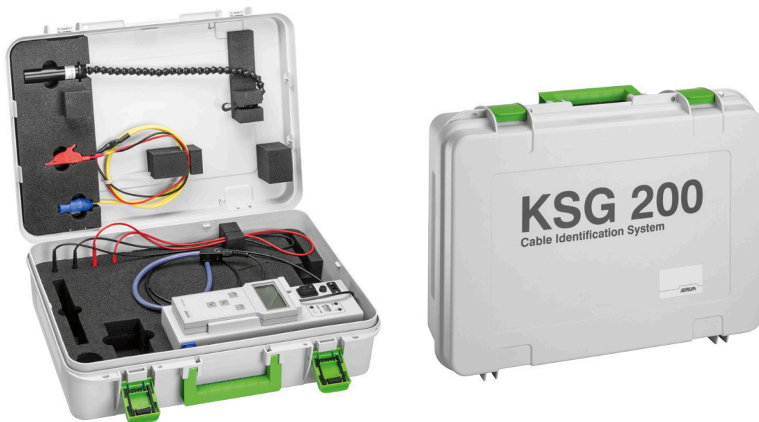
Figure: KSG 200 T (without battery)